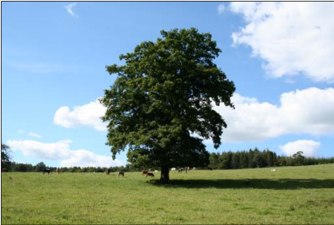
Life in the country – took this one whilst out walking the dog about 5 minutes from my house

I just got a new digital camera and have been out and about snapping happy! I'm going to take the camera out with me into the local forests and see if I can catch some of the deer on film – they're pretty shy but I've seen a lot of them when I've been out walking.