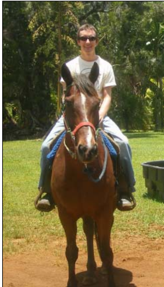
John Wayne eat your heart out – horseriding in the mountains where Jurassic Park was filmed (I think I might have heard a voloceraaptor)..