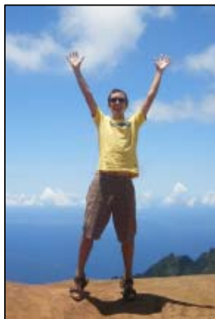
On top of the world at Waimea Canyon, just miles from the wettest place on earth (forty FEET of rainfall per year)