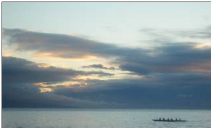
Long boat canoe-type thing in sunset