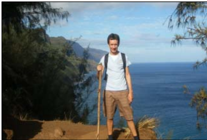
Looking like Gandalf during a hike along the high sea cliffs of Kauai's Na'Pali coast