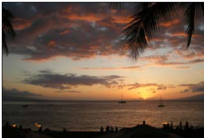
Sunset on Maui – this was taken from our seat at a restaurant on our final night in Maui