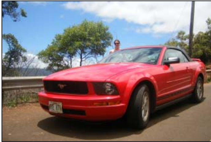
This is the Mustang we drove round Kauai (my wife is hiding in the background!)