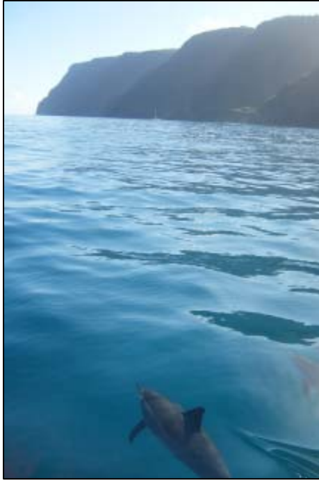
Dolphins swimming off the bow of our boat – awesome!

So there you go – I had a great time and will be going back some time, hopefully to do whale-watching during the winter months.