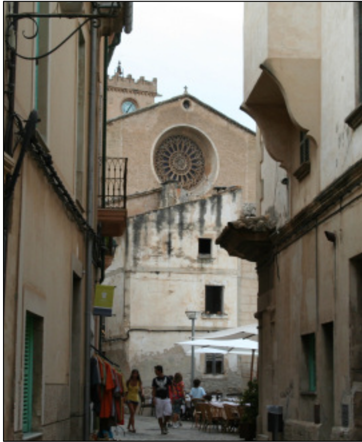
The twisting streets of old town Pollenca