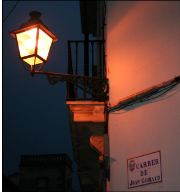
A Mediterranean night lights up