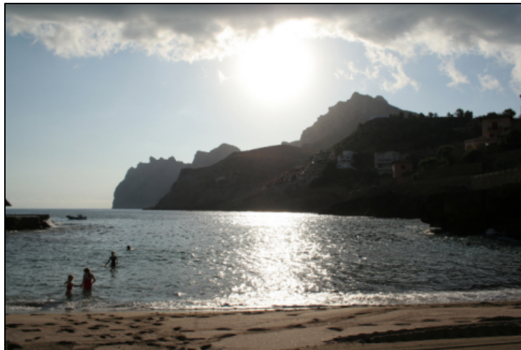
The idyllic beach – the water was so warm!